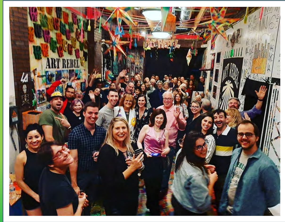
2019 Fundraising Exhibition