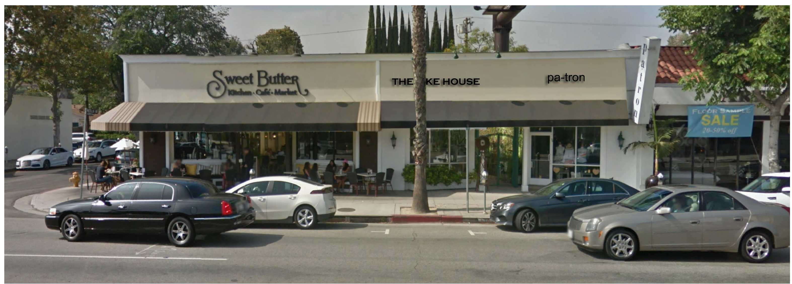
4 PROPOSED STORE FRONT ELEVATION Scale: NTS